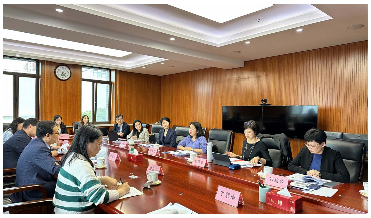
The AFRC delegation paid a three-day visit to Mainland authorities in Beijing.

The visit not only strengthened mutual understanding of the regulatory approach in Mainland China and Hong Kong, but also paved the way for the AFRC to establish a more comprehensive cooperation mechanism with the Mainland authorities.