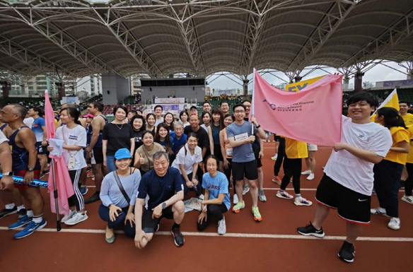
The AFRC showcases its 'One Team One Culture' spirit at the inaugural CPA Sports Carnival 2023