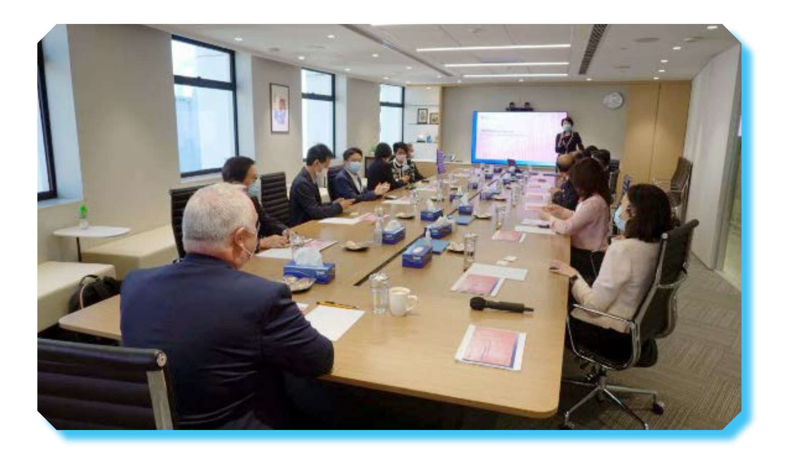
Briefing session for newly appointed members of the Financial Reporting Review Panel.