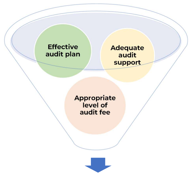
High-quality financial reporting

A well-planned audit plays a crucial role in assuring the quality of financial reporting. It allows management to identify and address potential issues preemptively before they become too costly, both legally and economically, or too late to manage. Moreover, it assists entities in identifying weaknesses and making improvements to their financial reporting processes, providing benefits beyond compliance. Therefore, it is imperative for management and audit committees to engage auditors earlier and develop a comprehensive audit plan.