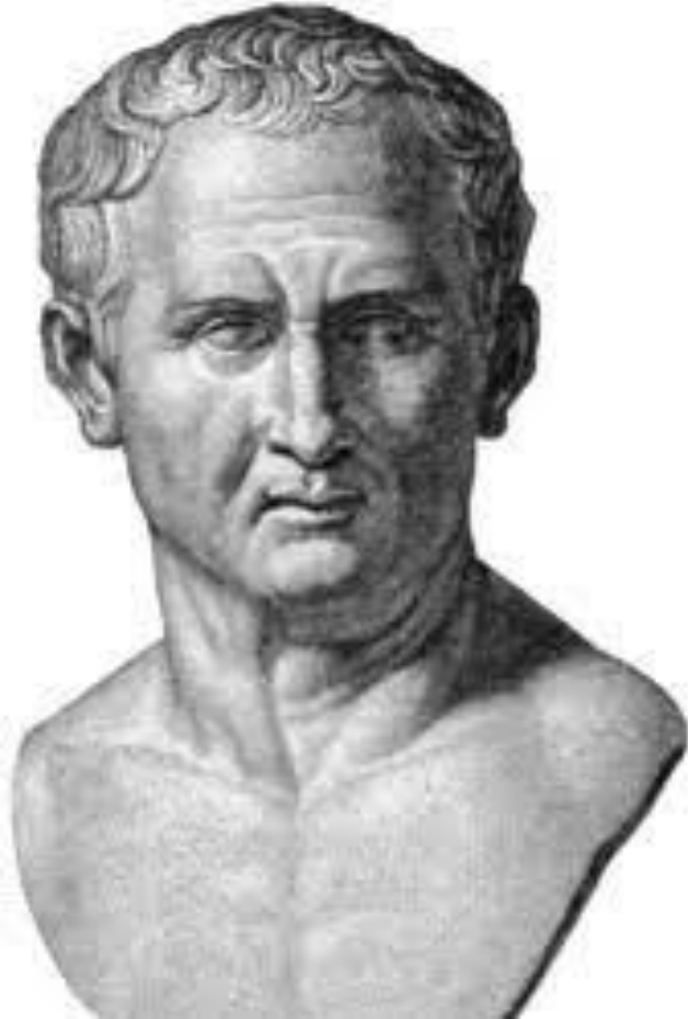
Gaius Tacitus (56 AD – 120 AD) Senator, historian of the Roman Empire

The happiness of the times is that when you may think as you wish and speak as you think.